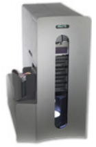
Rimage Producer III disc publisher records and prints labels on CD, DVD and Blu-ray Disc.

StorageQuest Reflector records discs using robotic disc publishers from leading manufacturers like Rimage™.