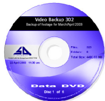
Automatically Prints Full Color Labels